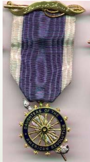
DAR member insignia with ancestor name on pin above

Do you have a Revolutionary Patriot in your family tree? Membership in the Daughters of the American Revolution (DAR) honors and preserves the legacy of your Patriot ancestor. Over two hundred years ago, American Patriots fought and sacrificed for the freedoms we enjoy today. As a member of DAR, through participation in the Society's various programs and activities, you can continue this legacy by actively supporting historic preservation, promotion of education, and patriotic endeavors. .